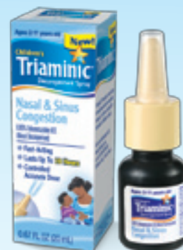
Xylometazoline HCl 0.05%